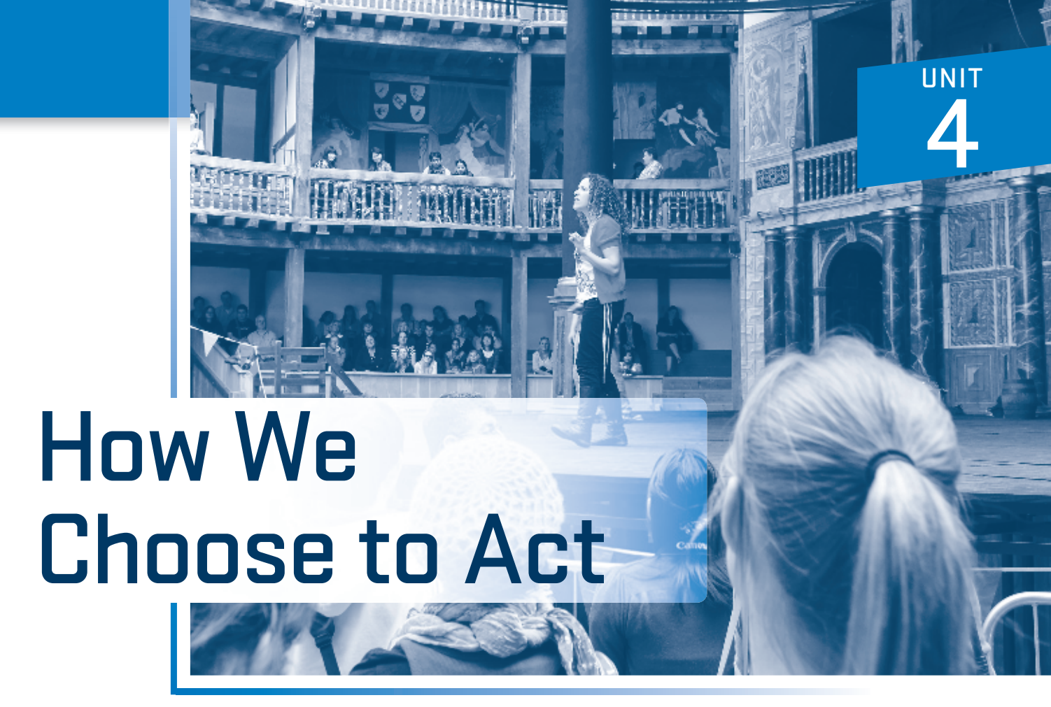
Visual Prompt: Study the scene in the photo. How does this scene relate to a monologue?